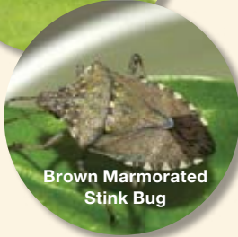
Brown Marmorated Stink Bug